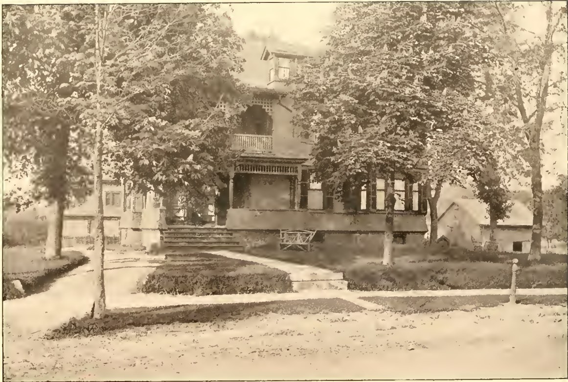
THE MANSE. ERECTED 1886.