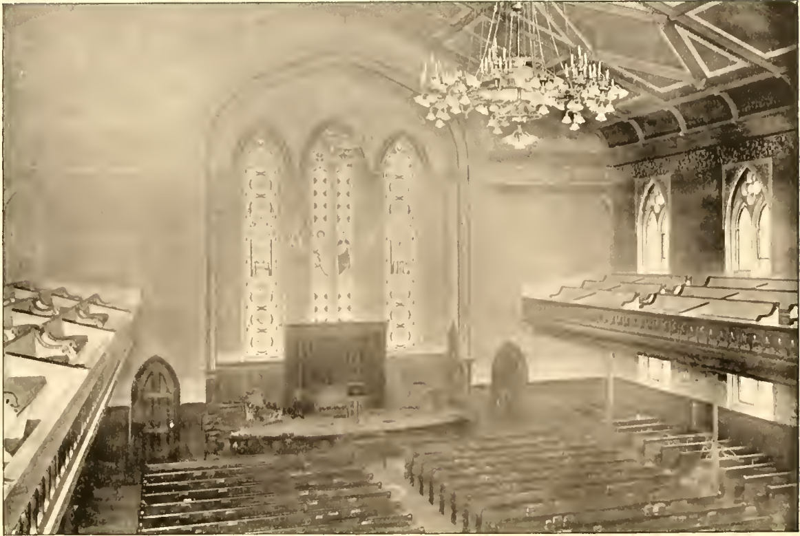
PRESENT INTERIOR, SHOWING CENTRAL CHANDELIER,

ONE HUNDRED GAS AND ONE HUNDRED ELECTRIC LIGHTS.