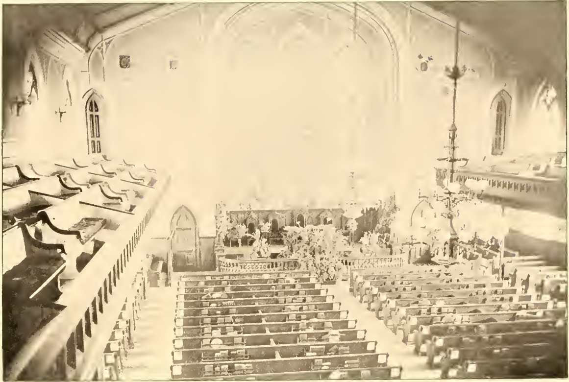
INTERIOR OF CHURCH, 1871.