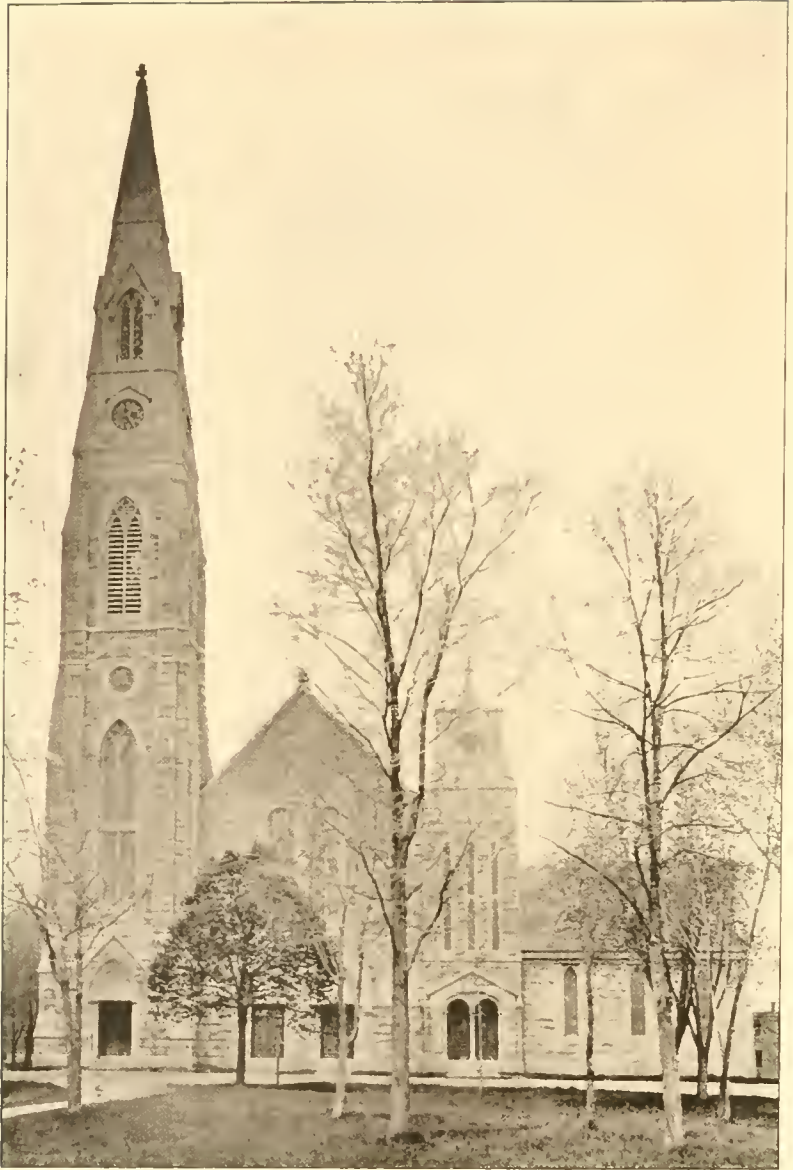
FIRST PRESBYTERIAN CHURCH, GOSHEN, N. Y., 1871.